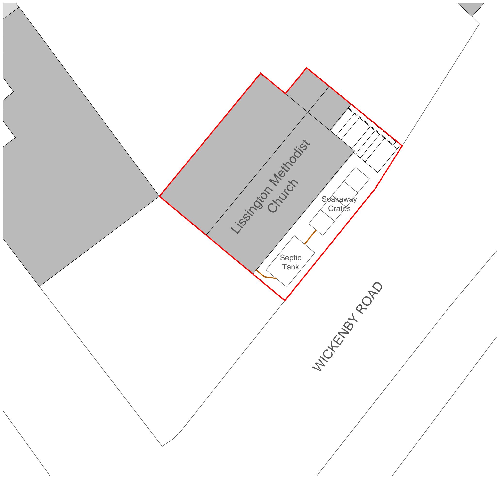
Septic Tank Location Plan Scale 1:100